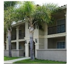
Vineyard Gardens Apartments Oxnard, CA

$4.4 Million Senior Bond 40% @ 40% & 60% @ 50% AMI