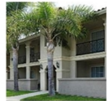
Vineyard Gardens Apartments Oxnard, CA

$4.4 Million Senior Bond 40% @ 40% & 60% @ 50% AMI