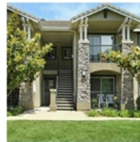
Seasons At Simi Valley Simi Valley, CA

$18.14 Million Senior Bond 100% @ 60% AMI