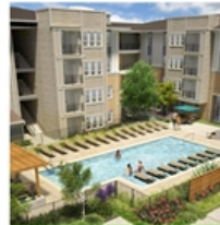
Bruton Apartments Dallas, TX

$18.14 Million Senior Bond 100% @ 60% AMI