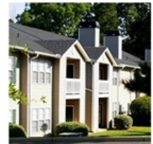
Bridle Ridge Apartments Greer, SC

$4.4 Million Senior Bond 40% @ 40% & 60% @ 50% AMI